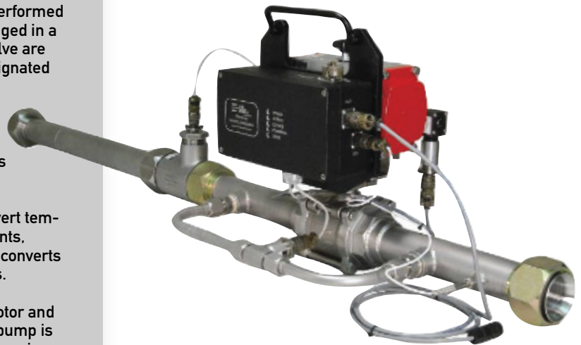
Two meter manifold used as secondary standard master meters for the FTS-CL calibrator

Flow Dynamics' primary standard calibration laboratory is NVLAP accredited, supplying both manufacturers and end users with dependable calibration results. All types of flow meter technologies are calibrated in liquid and gas. Throughout the global metrology industry, we are recognized as the calibration-lab-of-choice for customers demanding high-accuracy flowmeter calibrations traceable to the most rigorous international standards.